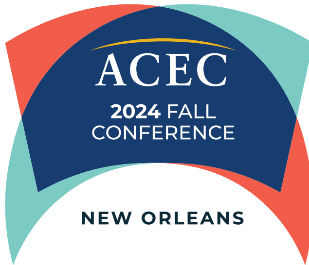
EXHIBIT AND SPONSORSHIP PROSPECTUS

2024 ANNUAL CONVENTION OCTOBER 20-23, 2024 HYATT REGENCY NEW ORLEANS, LA